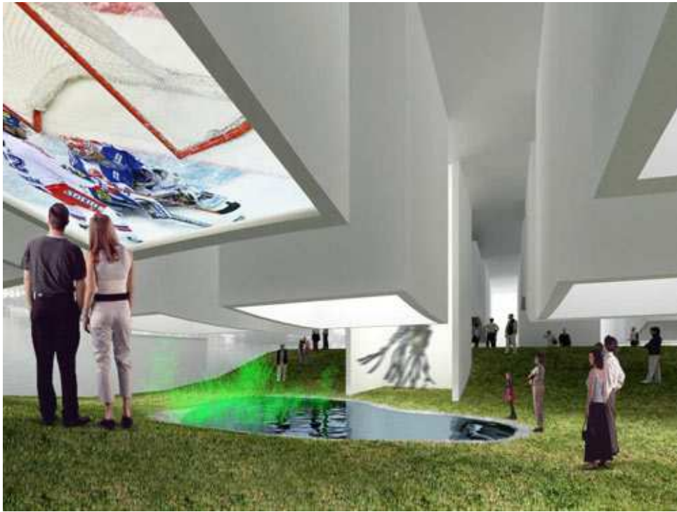
artistic rendition of the Czech Pavilion