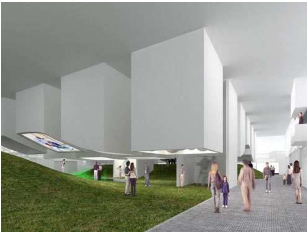
artistic rendition of the Czech Pavilion

The Czech Republic signed a participation contract with the Expo Organizer on January 23.