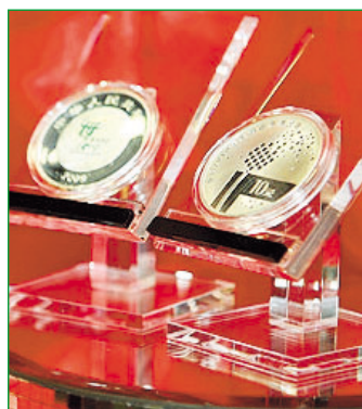
A set of gold and silver Expo coins to retail at 4,343 yuan.

The coins feature the Expo 2010 logo and the world. The gold coin has an image of Haibao, the Expo mascot, on the reverse. One of the silver coins has a dandelion and the other has the Shanghai skyline on the reverse.