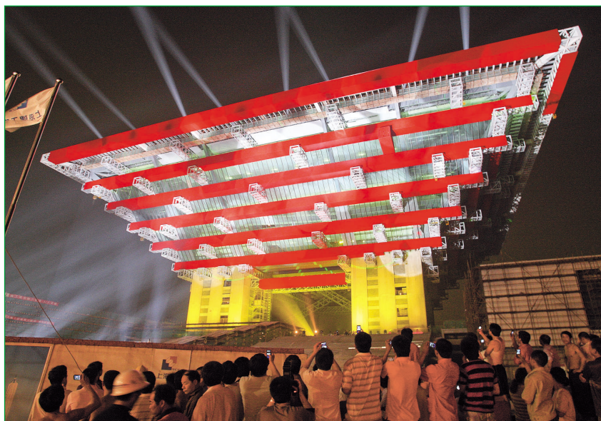
Shanghai residents snap photos of an illuminated China Pavilion on June 22. The lighting of the centerpiece structure on Expo Site was also to test the electricity supply by a newly built substation.

"Queues to toilets are unavoidable in the Expo Site, but we will promise no long queues," he said.