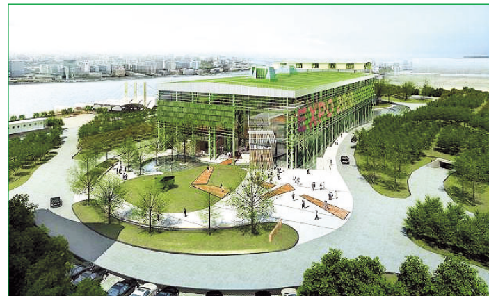
The Baosteel Stage is converted from a factory building.

Cirque du Soleil, a circus troupe from Canada will be the highlight at the Canada Pavilion. The world-renowned circus had already visited Shanghai back in 2006.