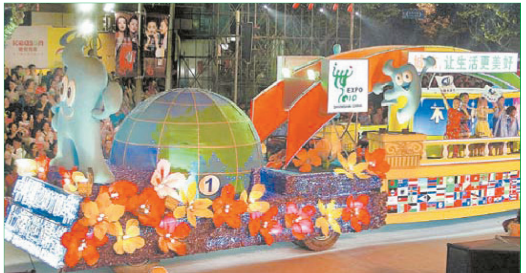
An Expo-themed float is a highlight in a parade on Huaihai Road on September 12 which marks the opening of the Shanghai Tourism Festival that runs until October 6. The parade of 22 themed floats attracted more than 400,000 onlookers.

City agencies will be promoting Expo-related tourism