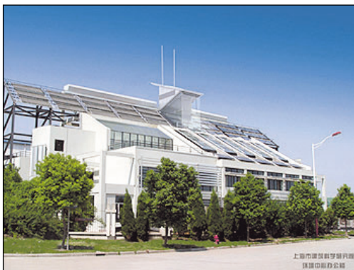
Project: Shanghai-EcoHousing City: Shanghai, China

The original building of Shanghai's demonstration project is in the Xinzhuang area, Minhang District. It will be rebuilt in UBPA's Simulated City Blocks. The Earth-friendly building automatically adjusts ventilation, lighting and air-conditioning according to people's needs and weather conditions.