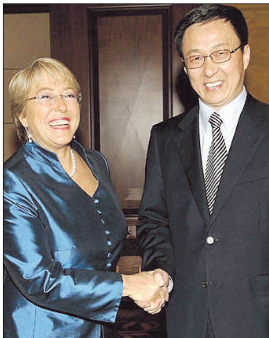
Shanghai Mayor Han Zheng and Chilean President Michelle Bachelet shake hands on April 15 in Shanghai after Chile signed its World Expo 2010 participation contract.

CHILE signed its World Expo 2010 participation contract with China in Shanghai on April 15, becoming the first Latin American country to commit officially.