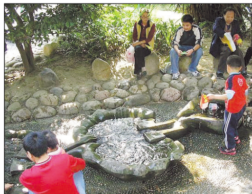
Project: Living Water Park City: Chengdu, Sichuan Province, China

Shanghai's neighboring cities will also take part. Suzhou in