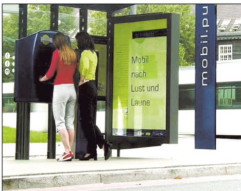
Project: From Knowledge to Innovation: Urban Mobility and Car-Pooling City: Bremen, Germany

The original building of Shanghai's demonstration project is in the Xinzhuang area, Minhang District. It will be rebuilt in UBPA's Simulated City Blocks. The Earth-friendly building automatically adjusts ventilation, lighting and air-conditioning according to people's needs and weather conditions.