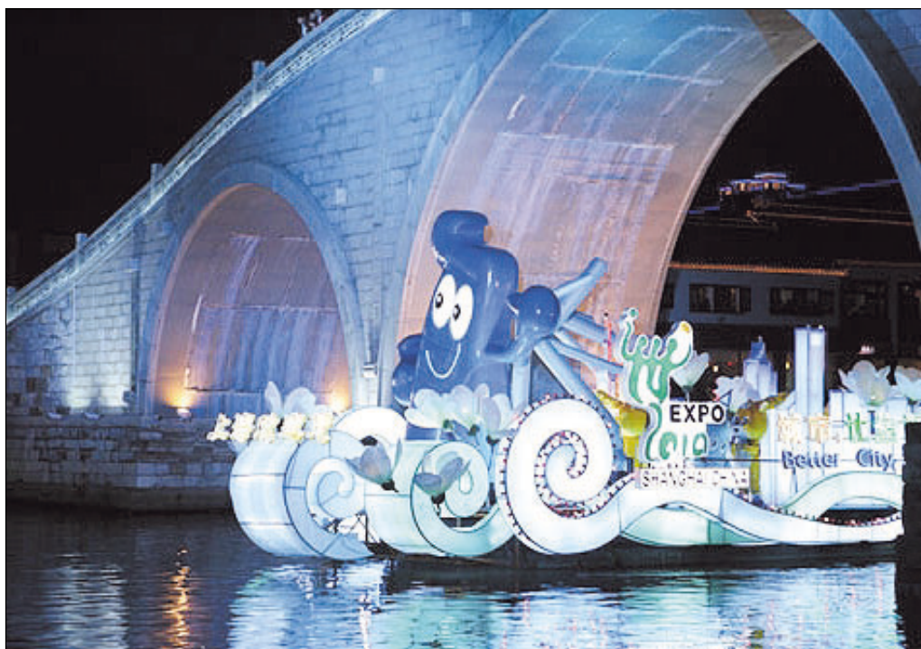
A colorfully decorated boat featuring Expo mascot, Haibao, cruises along the ancient Grand Canal in Suzhou, Jiangsu Province on April 18. A fleet of 21 boats took part in Suzhou's annual tourism festival.