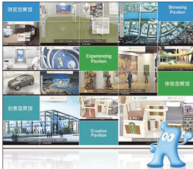
Expo Shanghai Online is the first in Expo history to offer people a virtual tour of the real thing.

• Basic Browse: A 3D view of any pavilion will provide a basic